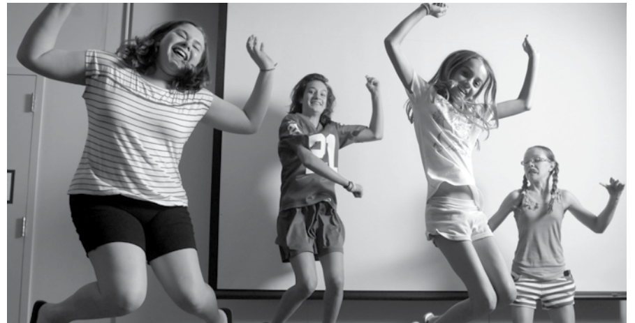
Jumping for joy at this summer's Teen Photography Workshop