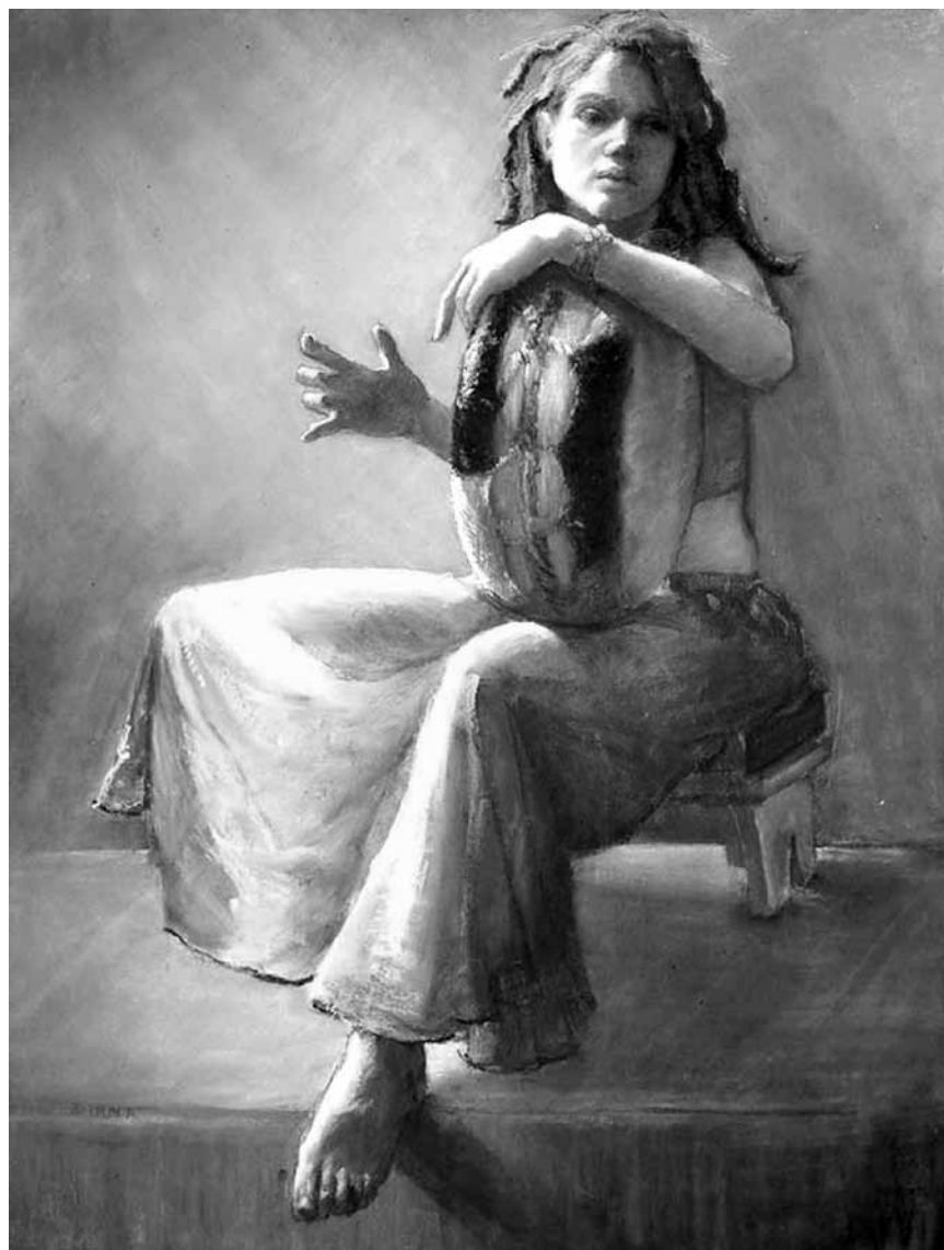
Little Drum , pastel • 40x30