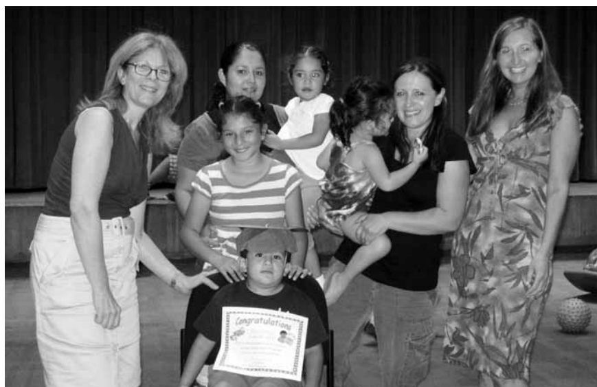
The Port Washington Public Library's Parent-Child Home Program had a wonderful year with eight children graduating. The PCHP is an innovative home-based literacy, school readiness and parenting program serving families of diverse populations that prepares the children for academic success. The library has participated in this program, which currently serves sixteen families in the Port Washington community, since 1998. Congratulations to our recent graduates! This program is co-sponsored by the Port Washington Public Library Family Place and funded with private donations to the Port Washington Library Foundation, the Judith C. White Foundation and United Way.