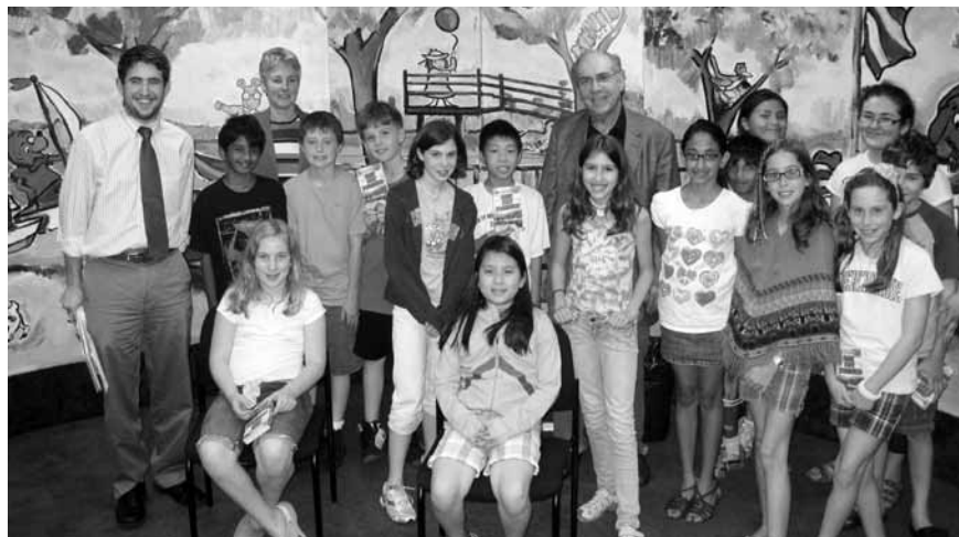
On Tuesday, June 14, fourteen students in grades 5 and up were treated to a special evening with celebrated sports journalist and author Robert Lipsyte. Participants listened to Mr. Lipsyte talk about his experiences growing up and discussed one of his most popular books for tweens One Fat Summer . Each student received an autographed copy of the title and a good time was had by all! This program was co-sponsored by the Friends of the Library.

Pajama Story Time: Tuesday, August 16 at 7 p.m. For children ages 5 and under with an adult. No registration required.