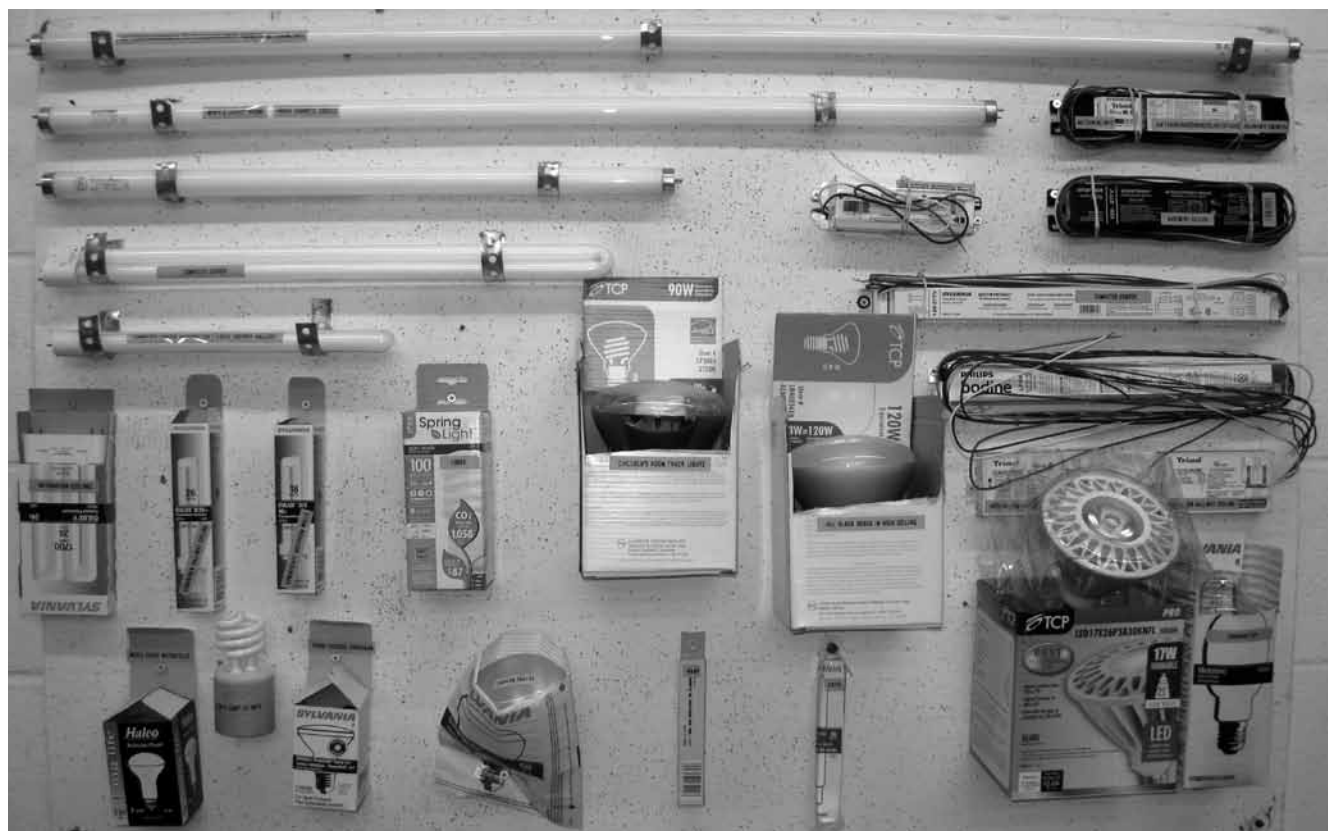
Samples of the energy efficient bulbs used throughout the building