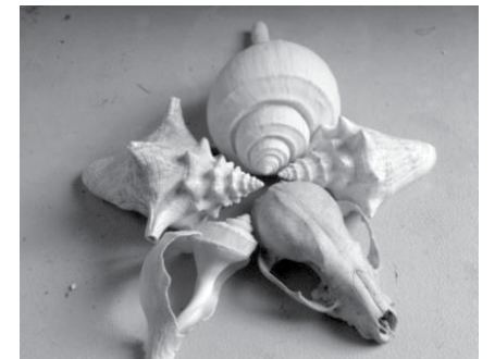
Student photo from a workshop earlier this year