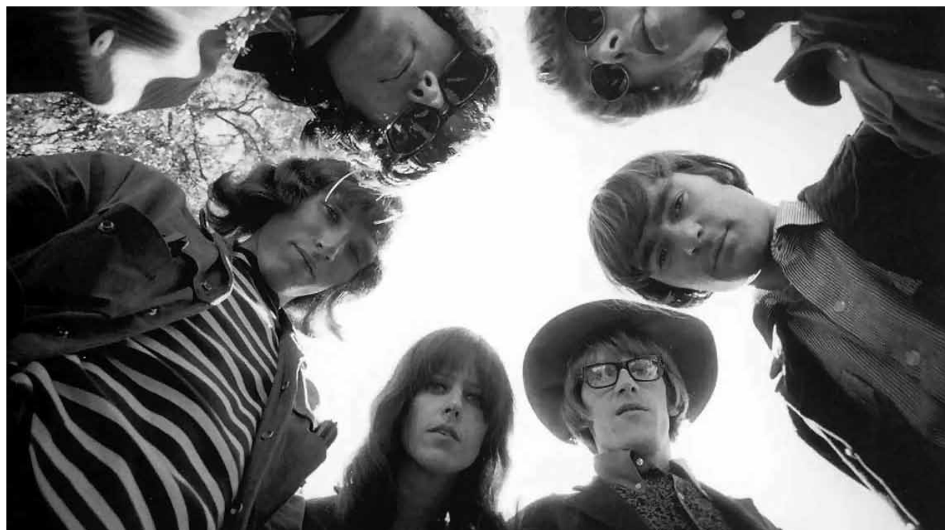
JEFFERSON SOUNDSWAP: Join us on Thursday, December 15 for a video-illustrated look at an influential yet underrated group of musical pioneers of the late 1960s. Story inside.