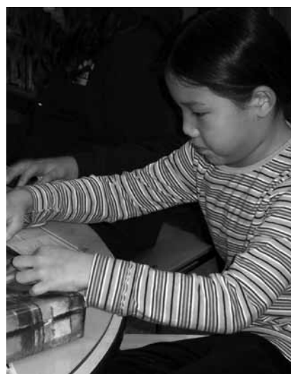
Tweens' Night Out

Page Turners – Tuesday, December 27 at 7:15 p.m. Monthly book discussion for children in grades 5 and 6. Call for availability.