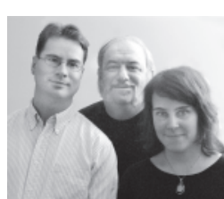
North River Band

JEAN RITCHIE FOLK CONCERT with North River Band and NexTradition. Sponsored by the Music Advisory Council. 3 p.m. Story in this issue.