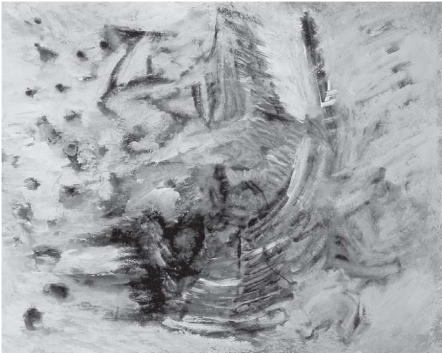
Floating Bones # 7