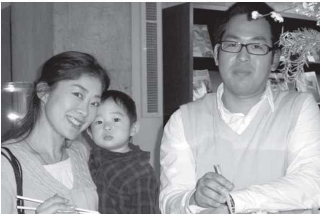
FACES IN THE NEWS: Last month's Asian Festival was a huge success with hundreds of community members enjoying crafts, food, performances, displays and demonstrations all celebrating Asian Culture.

Join us on Friday, May 16 at 7:30 p.m. for a special . . .