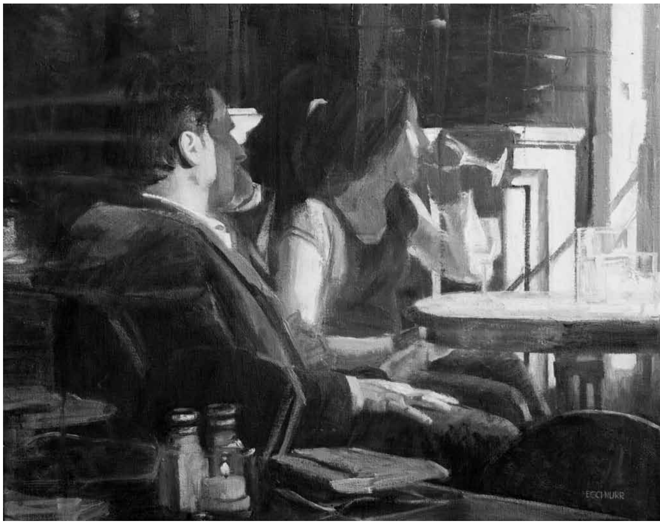
An Afternoon Moment II , oil on linen, 22" x 28," 2010