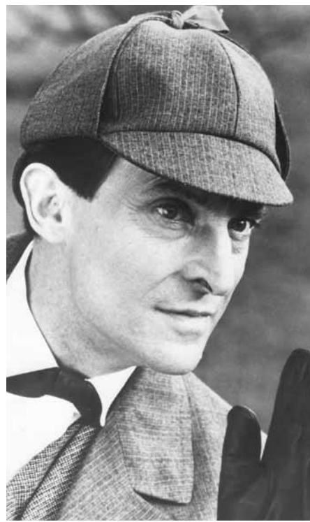
Jeremy Brett as Sherlock Holmes

Arthur Wontner: The Sign of Four • The Triumph of Sherlock Holmes