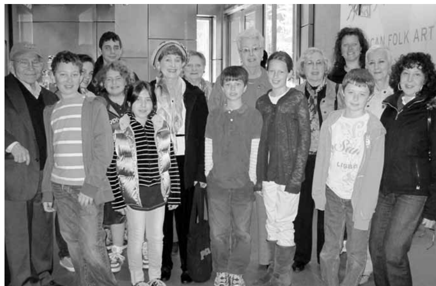
Participants in an Intergenerational Bus Trip to the American Folk Art Museum