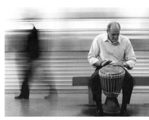
From The Visitor

"THE VISITOR" (2007-104 min.). Disaffected college professor Walter Vale (Richard Jenkins) strikes up a friendship with drummer Tarek (Haaz Sleiman) and his wife, jewelry maker Zainab (Danai Jekeesai Gurira), two illegal immigrants who have been tricked into renting Vale's little-used Manhattan apartment. Director Thomas McCarthy also scripted this touching cross-cultural drama. 7:30 p.m.