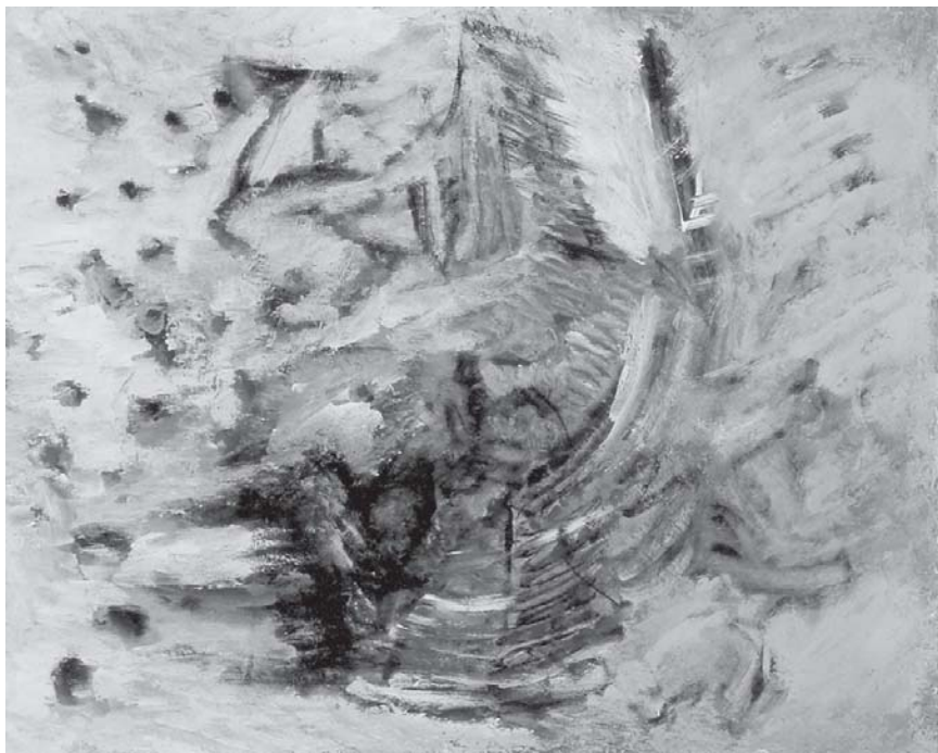
Floating Bones # 7