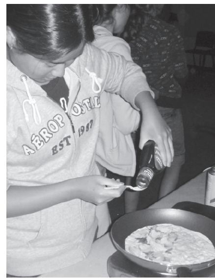
The library offers programs for teens throughout the year. Check this space for what's new.