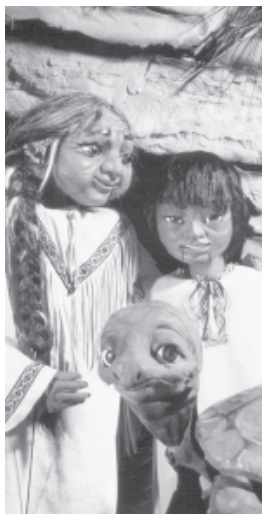
The Catskill Puppet Theater presents Hiawatha on April 22 at 2:30 p.m. Pick up tickets beginning April 14.