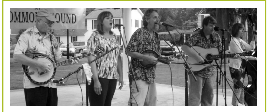
Celebrate LI Talent

driver, landscape crew foreman, air traffic controller, union rep and computer programmer. The singer, songwriter, guitarist has a style that embraces the blues, country, soul, folk and jazz.