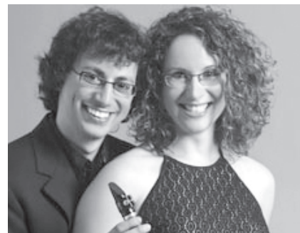
Brillaner Duo, music for clarinet & piano Sunday, January 13 at 3 p.m.