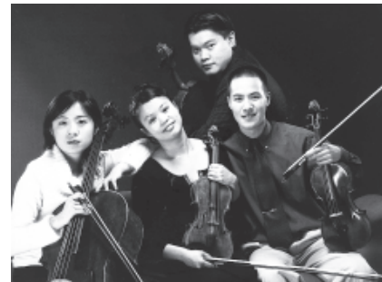
Formosa Quartet, strings Sunday, December 9 at 3 p.m.